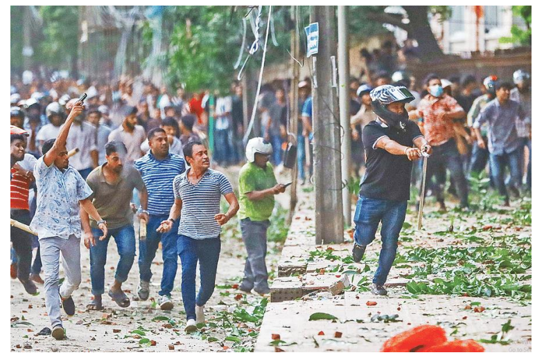
Three Chhatra League members with guns, seen firing at protesting students during clashes at Dhaka University. Photo: Prothom Alo: 16 July 2024.