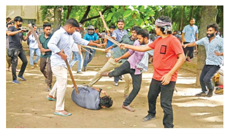
Quota reform movement protesters being attacked at Dhaka University campus by Chhatra League. Photo: Samakal, 16 July 2024.