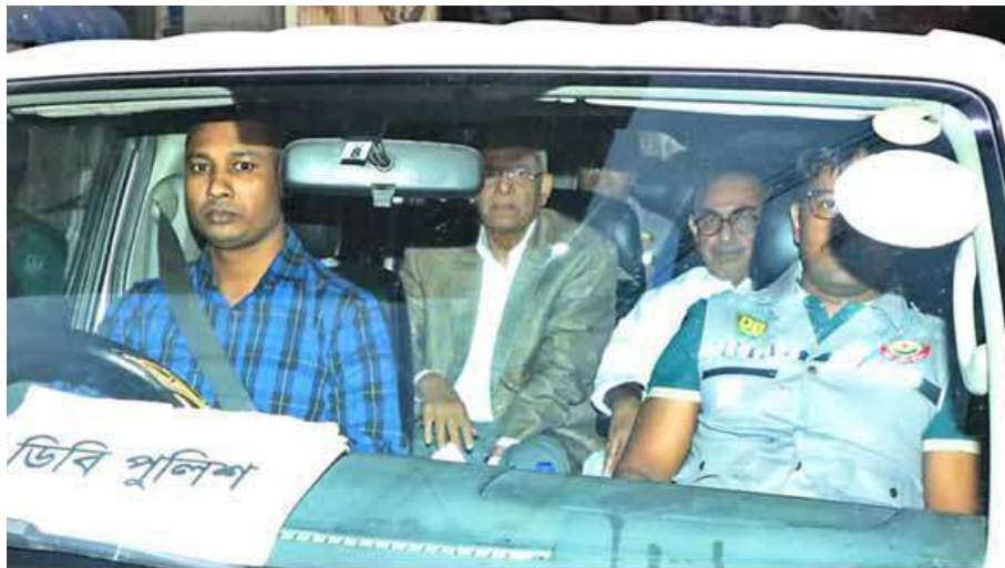
BNP Secretary General Mirza Fakhrul Islam Alamgir and the party's Standing Committee Member Mirza Abbas are being taken to jail from Dhaka Chief Metropolitan Magistrate Court.