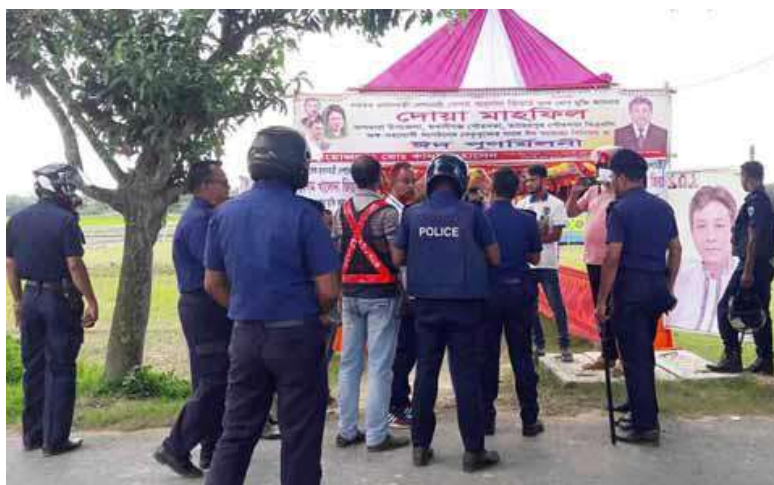
Police stopped a BNP Eid reunion and prayer ceremony in Bagmara. Photo: Prothom Alo, 14 July 2022

and prayer programmes, food distribution events, flood relief distribution events, symbolic hunger strike, distribution of leaflets, human chain and candle vigil programmes, etc. were attacked.