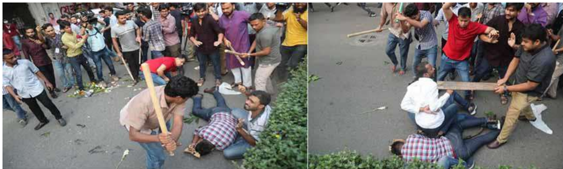
Chhatra League leaders and activists attacked Chhatra Dal leaders and activists when they entered the Dhaka University campus.