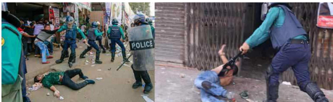
A person lying on the road after being injured during the police-BNP clash at Nayapaltan in Dhaka on 7 December. Photo: Prothom Alo, 8 December 2022; A policeman beating a man. Photo: Daily Star, 7 December 2022