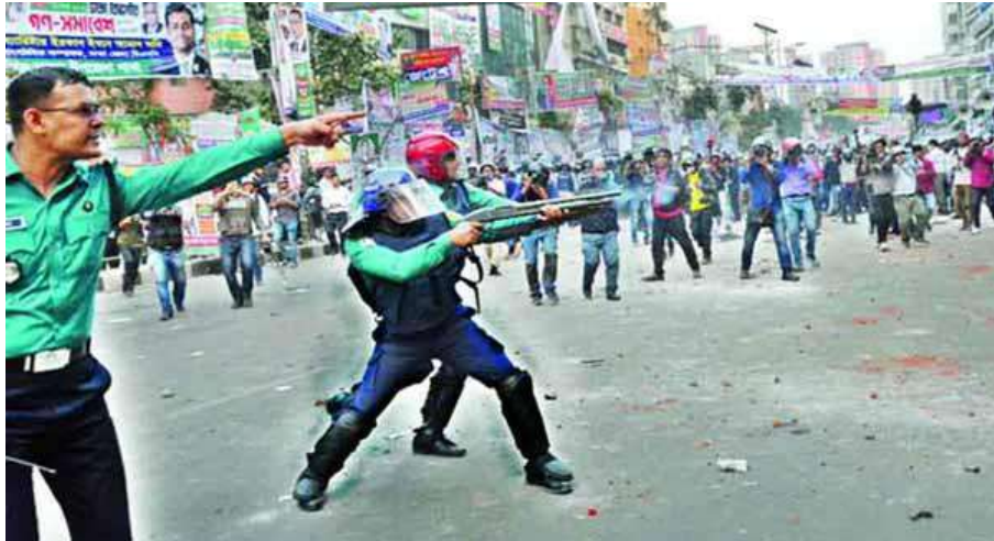
Police action against BNP leaders and activists in Nayapaltan in Dhaka City on 7 December.