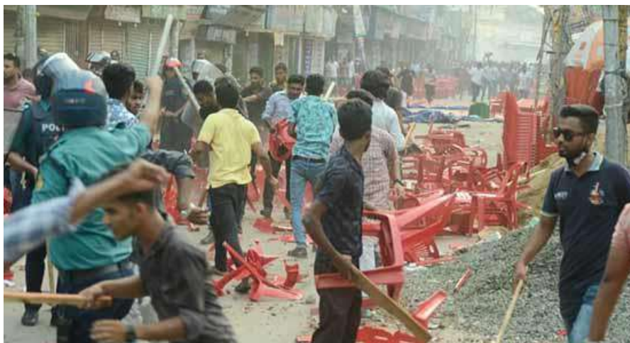
Chhatra League leaders and activists vandalize the stage and chairs in front of the BNP office in Khulna after an altercation.