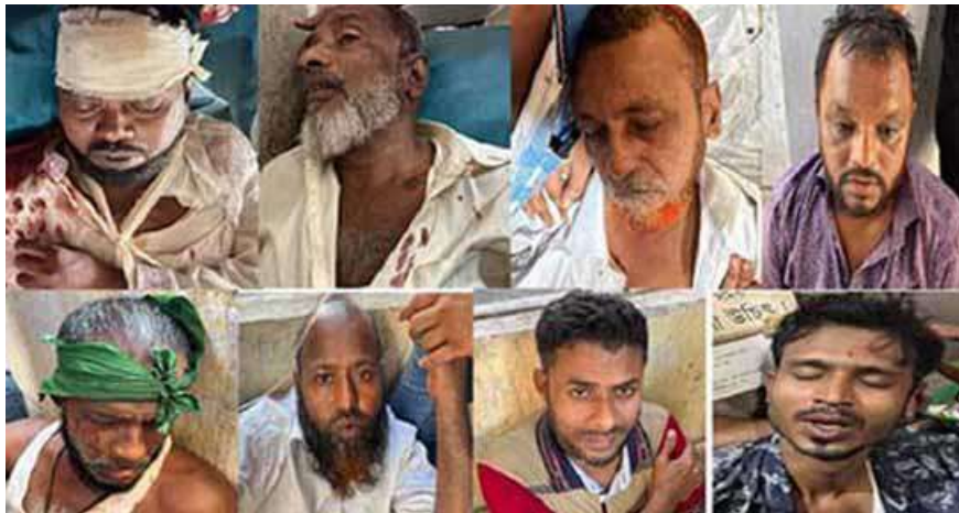
Injured BNP leaders and activists who were at a mass rally in Khulan.