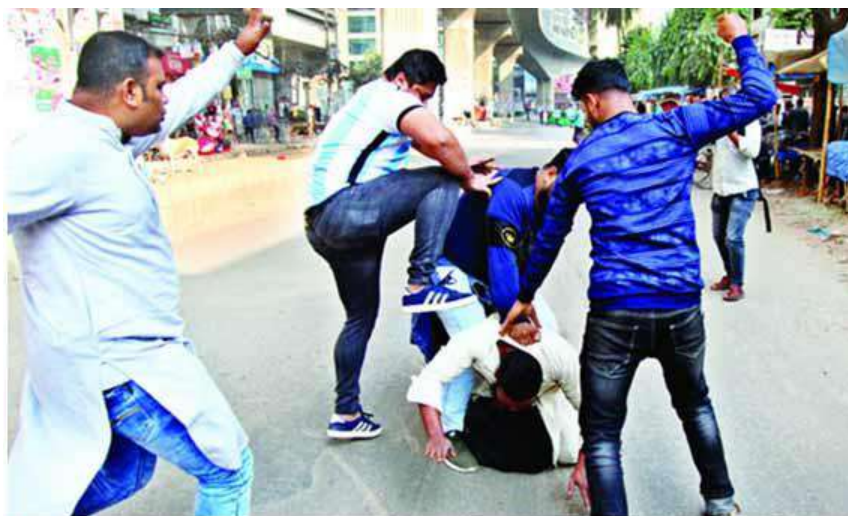
Awami League activists are beating a person on the suspicion that he was going to join the BNP mass rally.