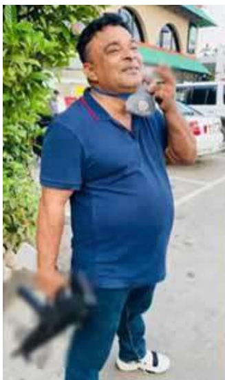
Jubo League (youth wing of AL) leader with sophisticated machine gun in Choudagram of Cumilla. Photo: Manabzamin, 14 July 2022