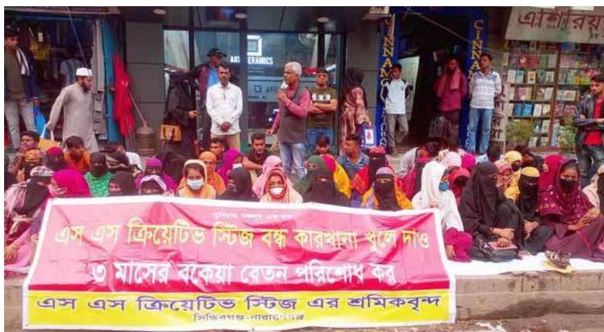
Workers' sit-in programme in front of BKMEA office in Narayanganj, demanding payment of arrears of wages. Photo: Prothom Alo, 15 December 2022

75. The human rights of labourers/workers have been violated in various ways in 2022. Although owners have built a mountain of profit in exchange for the blood and sweat of the workers in the ready-made garment industry, the government and the owners have been observed to act with indifference in various matters such as workers' safety, wages, health and medical care, maternity leave, trade union rights, etc. During this reporting period, there have been cases of factory closures and workers layoffs , non-payment of arrears of wages and inhuman treatment of workers in the garment industry and other sectors. The garment factory workers staged hunger strikes and protest rallies demanding arrears of wages. 197 During the protests and rallies of the workers, the police and men on the payroll of the factory owners attacked workers. 198 The police also registered false cases against the workers and arrested them. In 2022, workers of a private jute mill in Khulna staged a 'hunger' procession to demand payment of outstanding dues. 199