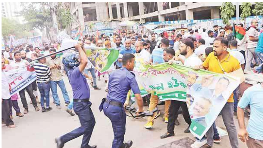
Police attacked and stopped a procession brought out by Narayanganj City and District unit BNP on the occasion of the party's founding anniversary. Photo: Prothom Alo, 4 September 2022