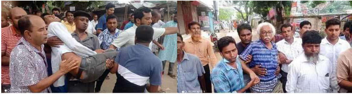
Injured CPB leaders and activists who were attacked by the ruling party activists and the police during a meeting Photo: Prothom Alo, 10 September 2022