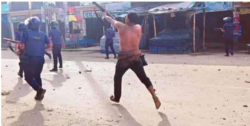
BNP activists clash with the police over a programme in Muktarpur of Munshiganj. A member of the police is seen firing his rifle.