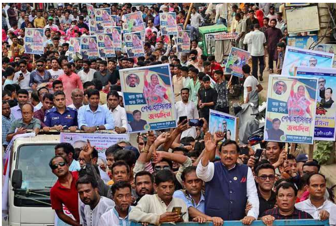
On the occasion of Prime Minister Sheikh Hasina's birthday, top officials of the local administration and police are seen in the pick-up van at an Awami League procession in Patia of Chittagong. Photo: Prothom Alo, 30 September 2022