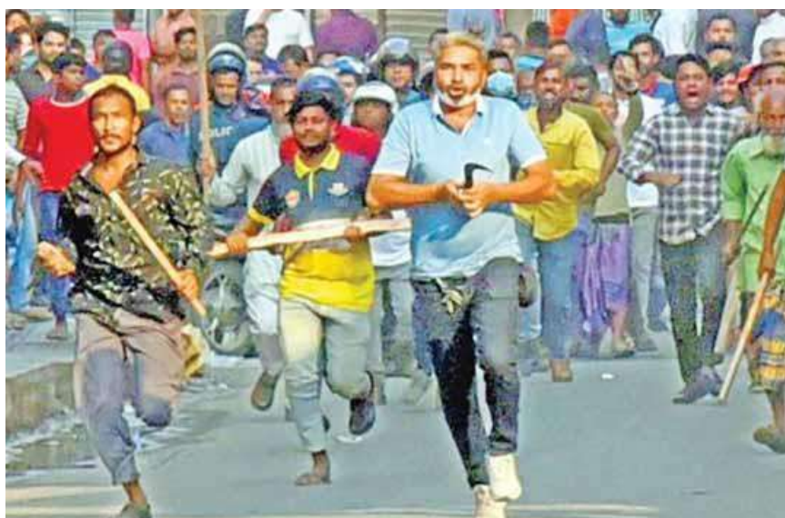
Awami League activists in front of Buddhist Temple at Basabo, Dhaka.