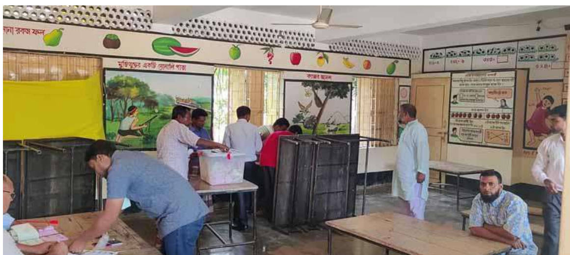
Not a secret ballot. Voters in the same polling booth at the Shanta Gurni Government Primary School of Panchbibi Upazila of Joypurhaat District.