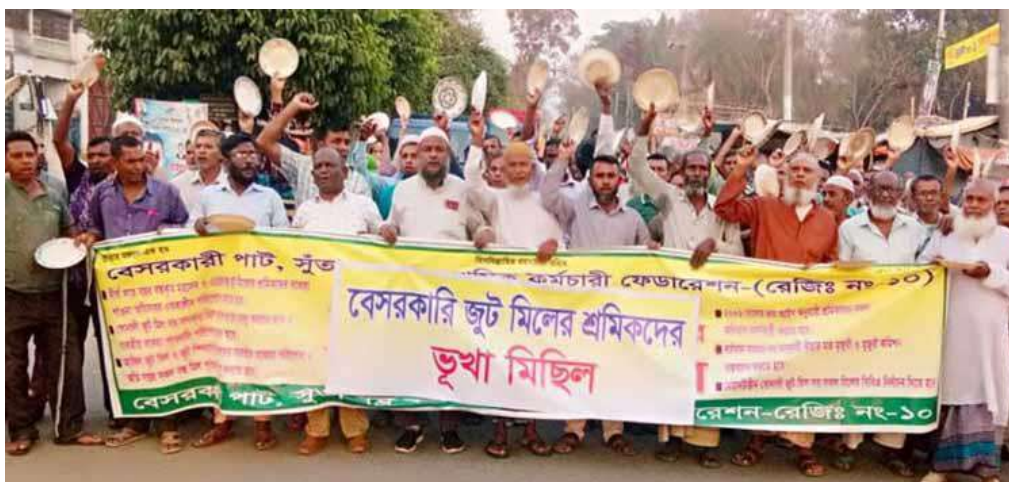
Jute Mill workers at 'hunger procession' demanding the payment of dues.