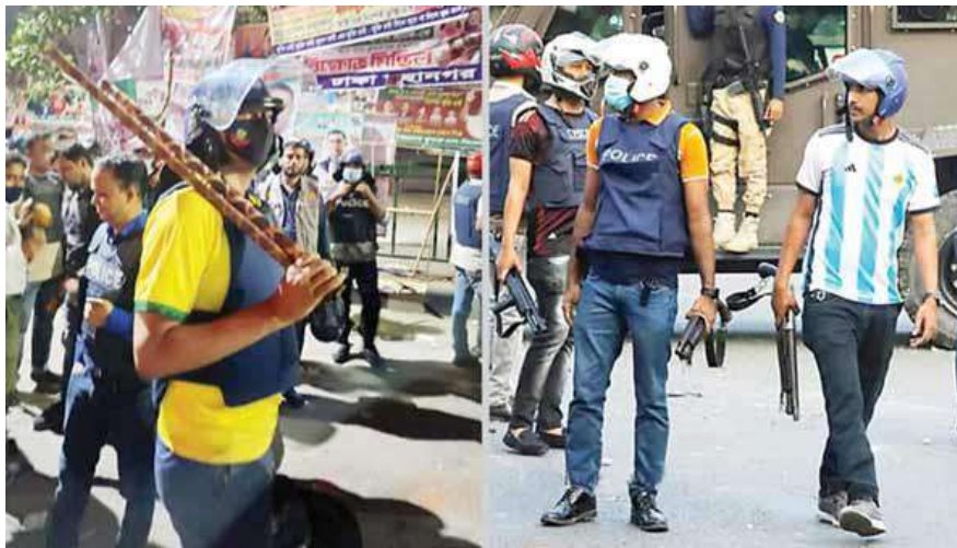
A person, left, in a Brazil football jersey donning a police vest and a helmet, carries two sticks while another person, right, in an Argentina football jersey carries a shotgun, and was seen firing at BNP activists during a clash with police at Naya Paltan in Dhaka.

have been named, and accusing another 2975 leaders and activists. In the night of 9 December, BNP Secretary General Fakhru Islam Alamgir and Standing Committee member Mirza Abbas, were arrested by the Detective Branch (BD) of Police from their residences without any warrant. The government blockaded Dhaka City due to the 10 December rally. Members of the law enforcement agencies and Awami League leaders and activists took position on the roads entering Dhaka. They harassed ordinary citizens, including searching their cell phones. 68 If there was any suspicion that they had come to attend the BNP rally, Awami League leaders and activists attacked them and beat them up , suspecting them to be BNP leaders and activists, and handed them over to the police. 69 Acts of enforced disappearance also happened. After arresting some BNP leaders and activists, who had come from outside Dhaka to join the rally, it is alleged that members of the law enforcement agencies denied the arrests. 70