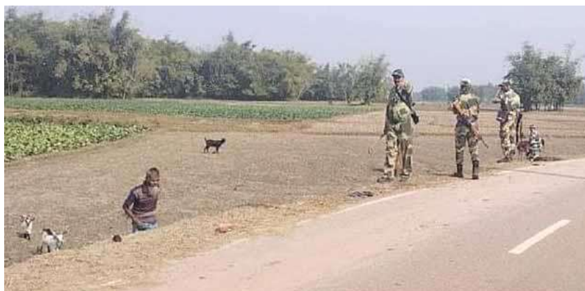
BSF members illegally entered Dahagram Union under Patgram Upazila of Lalmonirhat. Photo: Prothom Alo, 9 February 2022

Brahmanbaria and removed the memorial plaques of the freedom fighters , who were martyred during the 1971 Liberation War at the border and barred the construction of roads within Bangladesh at Phulbaria border in Kurigram. These are violations of international law.