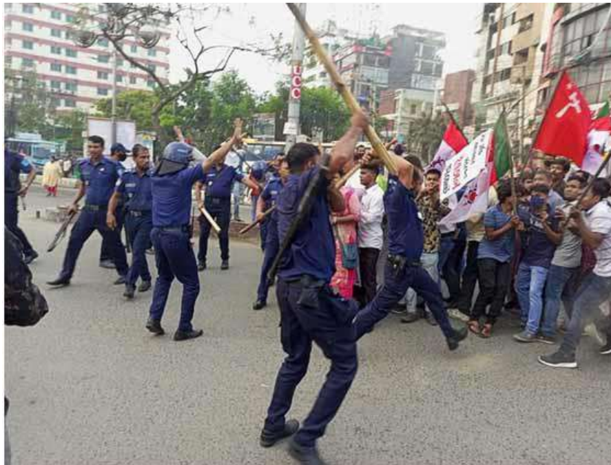
The police baton charged a procession in support of the strike of the Left Democratic Alliance at Chashara area of Narayanganj City. 28 March 2022