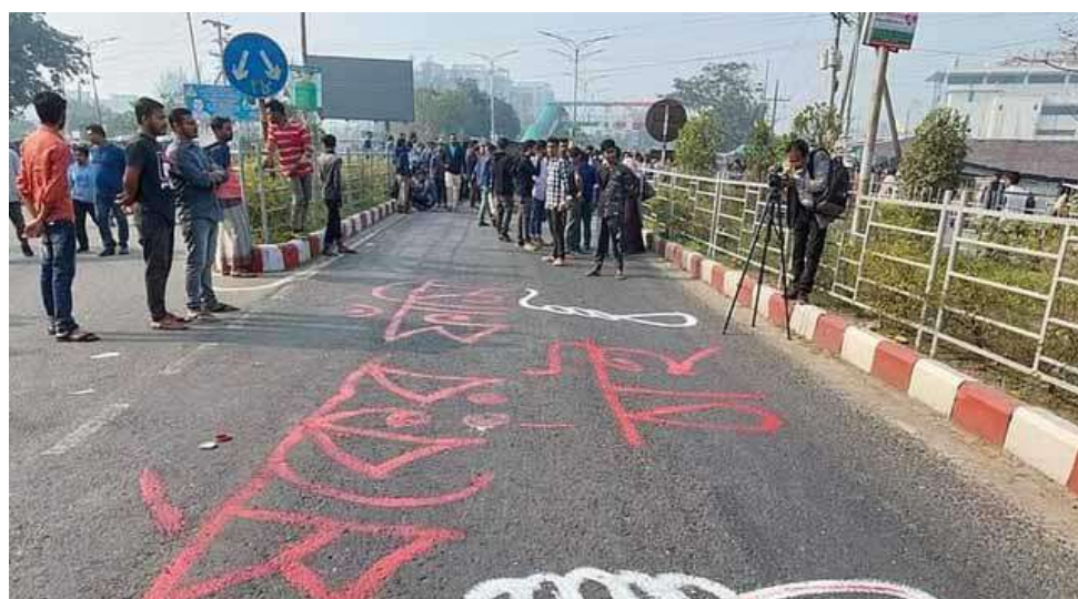
A student of Bangabandhu Sheikh Mujibur Rahman University of Science and Technology in Gopalganj was gang-raped. Students in protest of the rape, blocked the Dhaka-Khulna highway at Ghonapara intersection of Gopalganj.