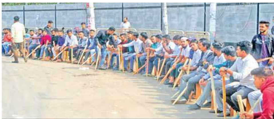
Awami League activists holding sticks in front of Bangladesh Bank at Motijheel, Dhaka during the divisional rally of BNP. Photo: Jugantar, 11 December 2022