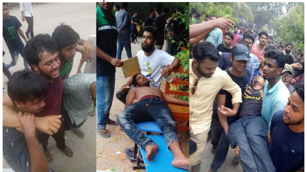
Protesting students injured by criminals attacks.

were the ruling party leaders and activists of Gopalganj town and the victims did not dare to file complaints due to fear.<sup>56</sup>