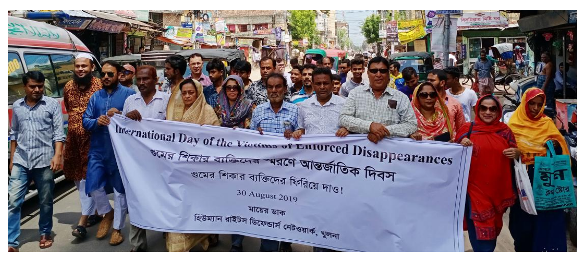
Human Rights Defenders' Network of Odhikar and Mayer Daak organised a rally in Khulna to mark the International Day of the Victims of Enforced Disappearances.