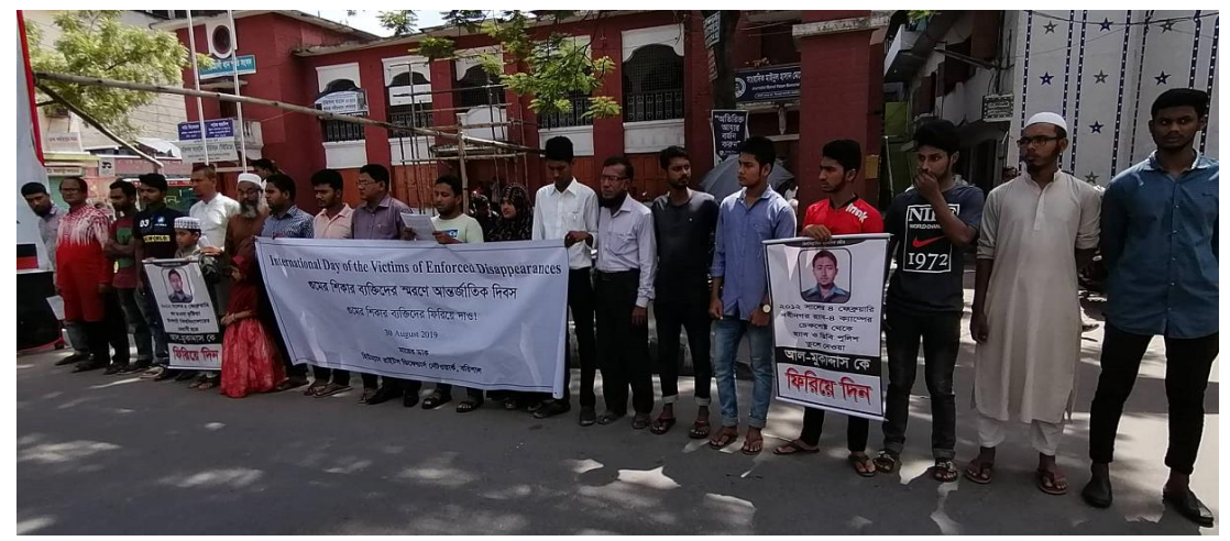
To commemorate the International Day of the Victims of Enforced Disappearances, Human Rights Defenders' Network of Odhikar and Mayer Daak formed a human chain in Barishal.