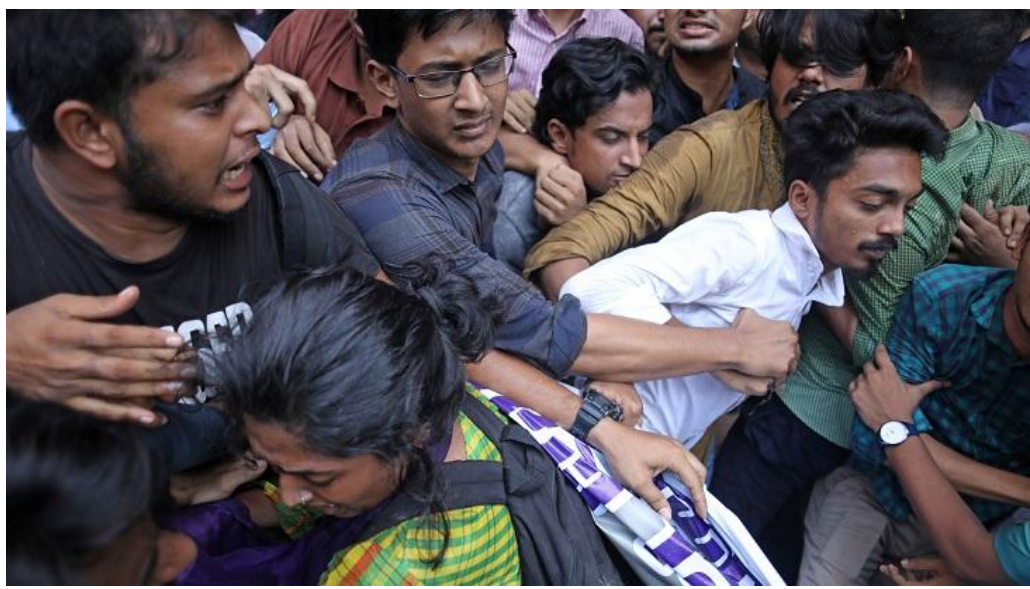
Chhatra League activists attacked the procession brought out by Bangladesh General Student Rights Protection Council. Photo: Jugantor, 19 September 2019.

students were injured when Awami League-backed Chhatra League activists attacked them.<sup>54</sup>