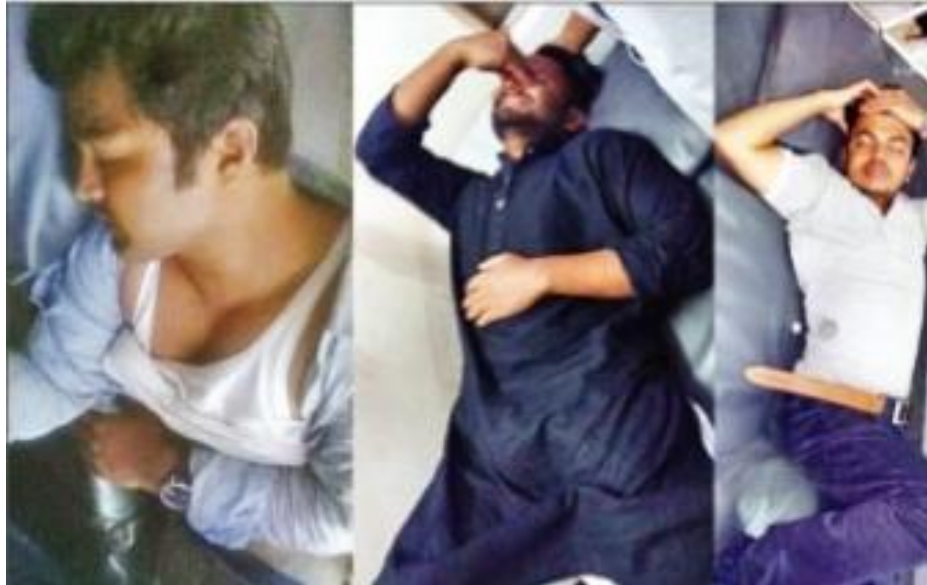
Dhaka University students wounded by Chhatra League activists.