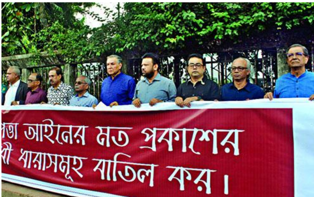
The Editors Council organised a human chain in front of the National Press Club and demanded the amendment of the Digital Security Act.