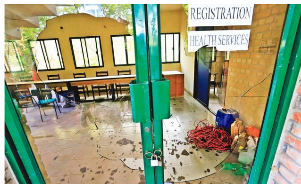
Female students’ dormitories of Gonoshasthaya Kendra after attack. 27 October 2018