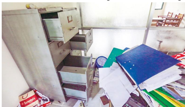
Criminals vandalised Gonoshasthaya Kendra at Ashulia. Photo: New Age 27 October 2018