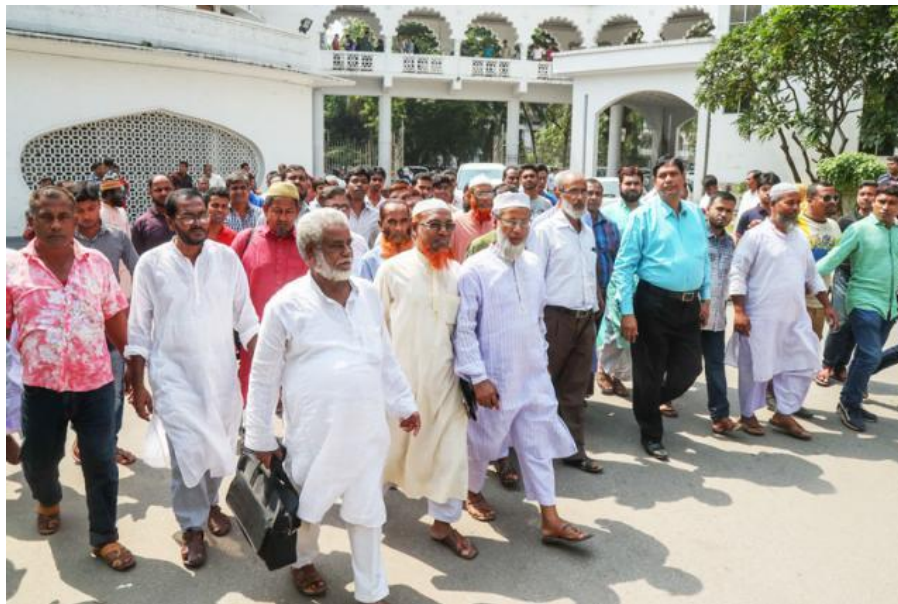
People from Jessore have come to the High Court for anticipatory bail on 'unauthorised' cases filed against them.