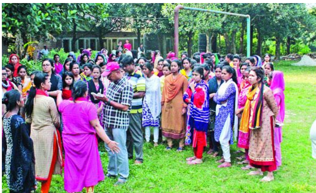
Journalists talking to the students at Gonoshashtha Kendra after the attack.

39. It is to be mentioned that dissenting citizens are being accused of ‘sedition’ due to their opinions against the wrongful actions of the government. According to the Fifteenth Amendment to Constitution, the highest punishment of sedition is the death sentence. Criminals affiliated to the ruling party or government who are involved in various criminal activities, are enjoying impunity.