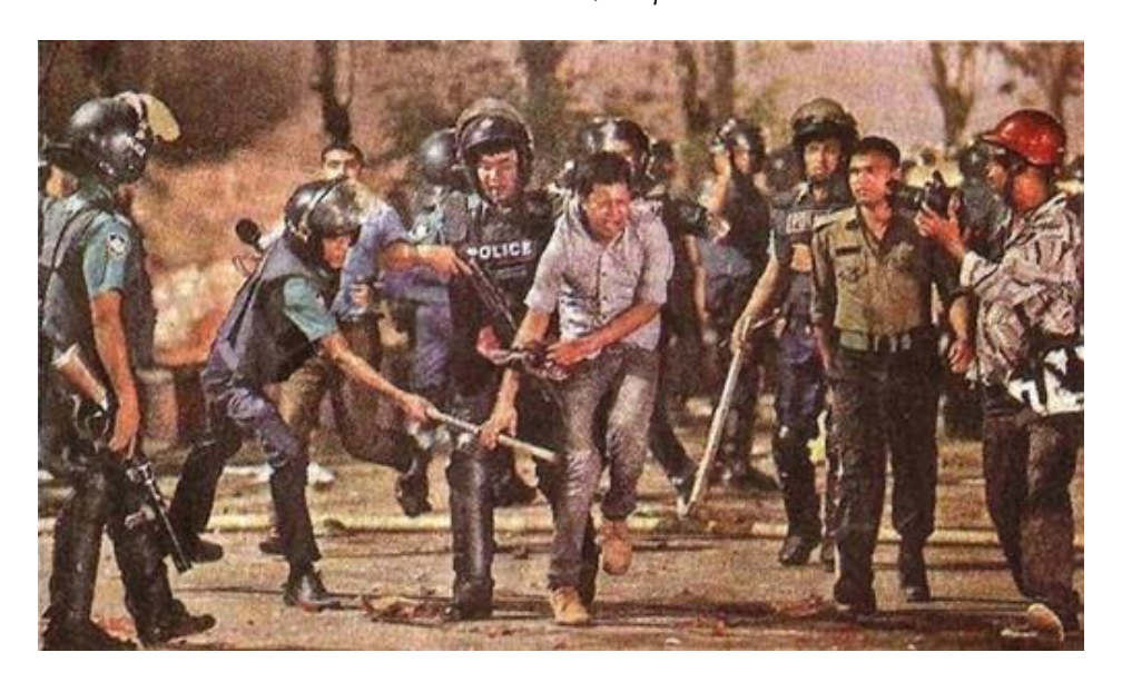
Police beating a protestor at Shahbagh Dhaka. Photo: Prothom Alo, 10 April 2018