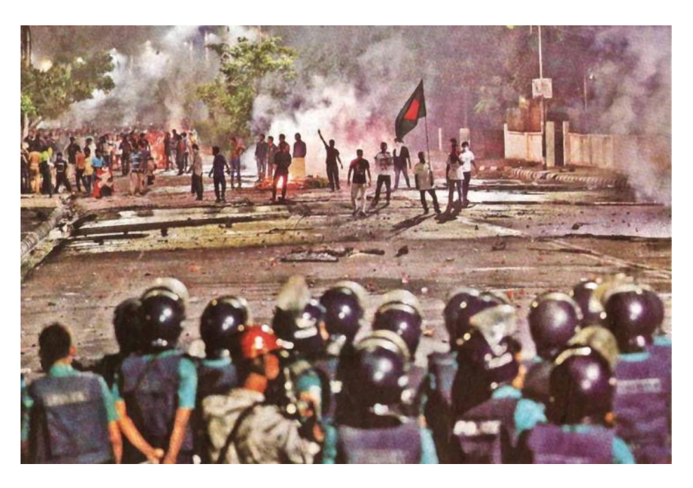
Police throwing tear gas shells at students in protest at a Dhaka demanding quota reform in government service. Photo: Prothom Alo, 9 April 2018

more than 100 students were injured.<sup>16</sup> After that incident, at midnight, some unknown people attacked the residence of the Vice-Chancellor of the University of Dhaka and vandalized the house.