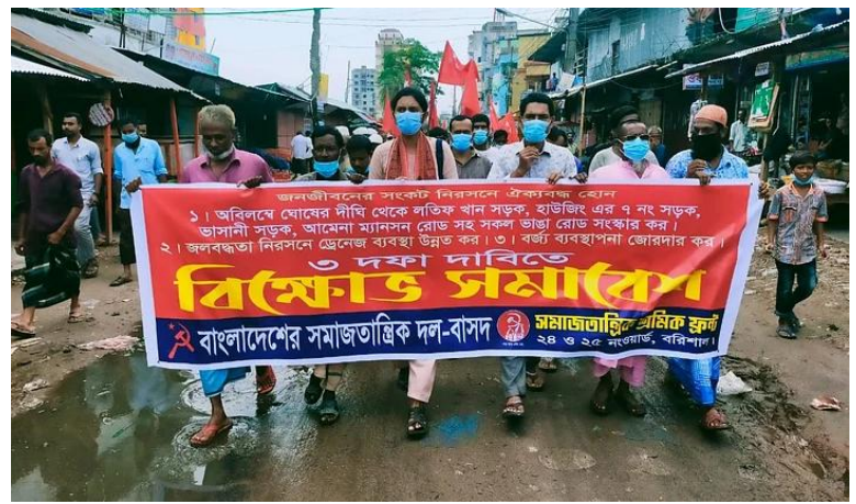
SPB protests in Barishal demanding road repairs and removal of water logging. Photo: Prothom Alo, 14 June 2021