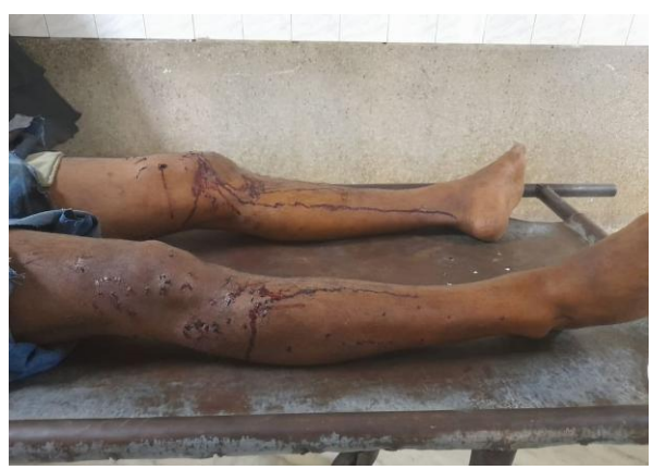
One of the wounded workers at the Tongi mill gate. Photo: Prothom Alo, 10 May 2021