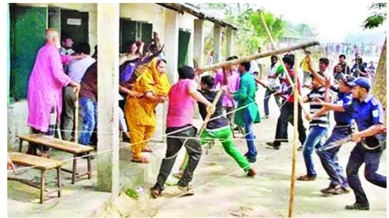
Supporters of two UP member candidates clashed at Charfakira co-ed Government Primary School polling centre in Ward 5 of Hazariganj Union under Char Fashion Upazila in Bhola.