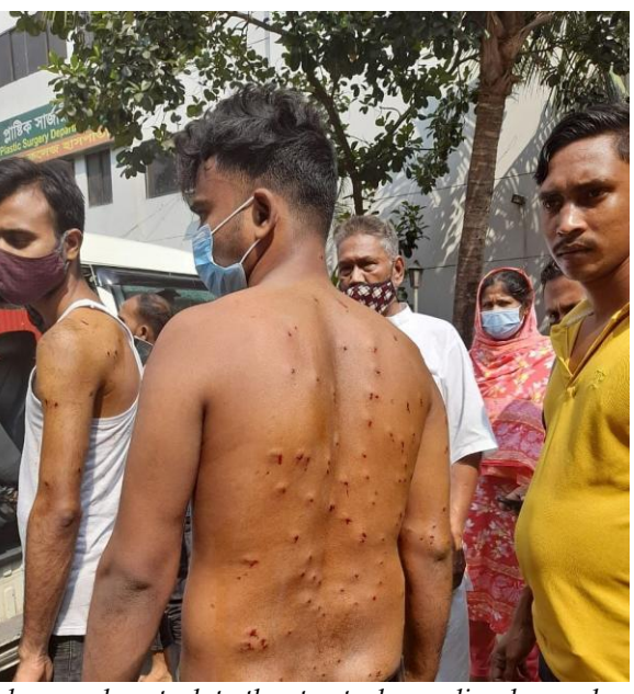
Police fired rubber bullets when workers took to the streets demanding longer leave.