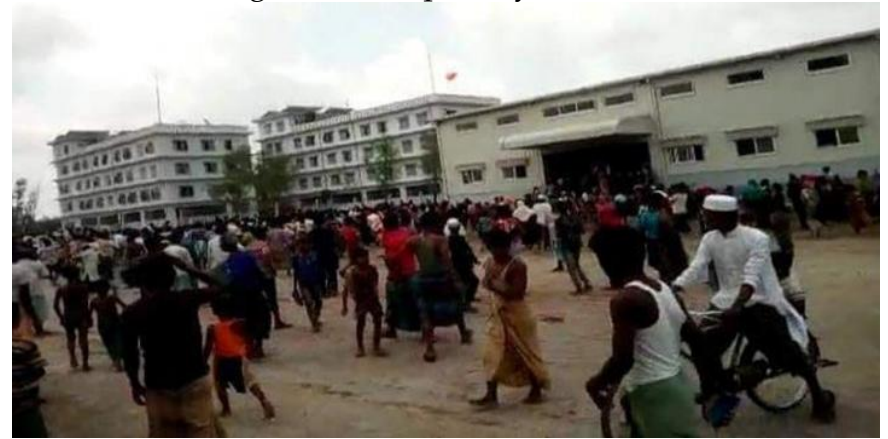
Rohingyas gather after seeing UN representatives.

They were also promised they would be able to meet their relatives in Cox's Bazar, but this was not implemented. They are also worried about the bad weather. In the rainy season, water often floods the low island and although some dams have been built, one of them was broken. The Rohingyas are worried about heavy rains and cyclones and the lack of protection. Meanwhile, some Rohingya refugees had fled Bhasanchar. The UNHCR said in a statement on 31 May that it was "deeply concerned" about the aftermath of the Rohingya protests in Bhasanchar. It stated that protection and healthcare of refugees are the priority of the UNHCR. 145