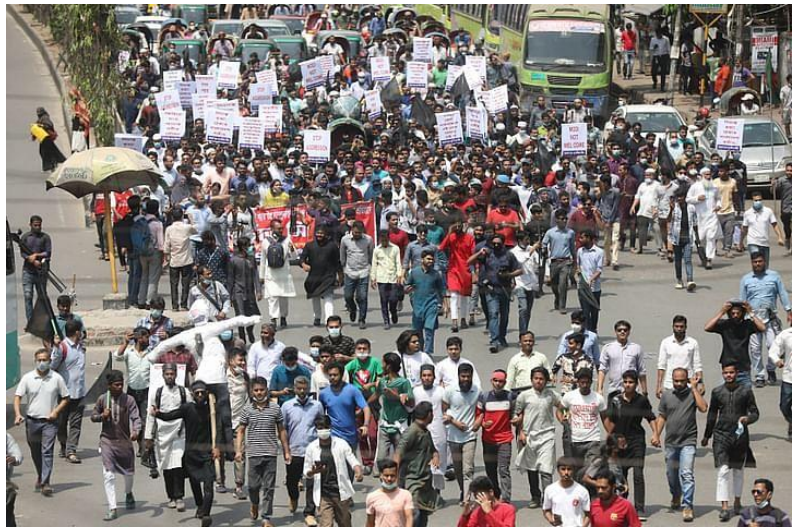
Protest rally of the Bangladesh Students and Youth Rights Council in Motifheel, in protest of Narendra Modi's visit to Bangladesh. Photo: Prothom Alo, 15 April 2021

1. During this period, the government carried out extensive acts of repression on the opposition political parties, organisations and dissidents. Police filed 154 cases in relation to clashes between Hefazat-e-Islam leaders and activists on one side and members of law enforcement agencies and ruling Awami League leaders and activists on the other, from 26 to 28 March. The protests had been organised by the Hefazat-e-Islam against Indian Prime Minister Narendra Modi's visit to Bangladesh. During the filing of the cases, the police accused a large number of anonymous persons – which made it easier for them to later arrest and include anyone in the case. Since the cases were filed, police have made mass arrests and detained 1,230 opposition leaders and activists, including members of Hefazat-e-Islam.<sup>24</sup> In addition, 53 leaders and activists of the Bangladesh Students, Youth and Labor Rights Council were arrested<sup>25</sup> and taken into remand through court, for holding rallies against Modi's arrival in Bangladesh. There are allegations that the detainees were tortured in remand.<sup>26</sup>