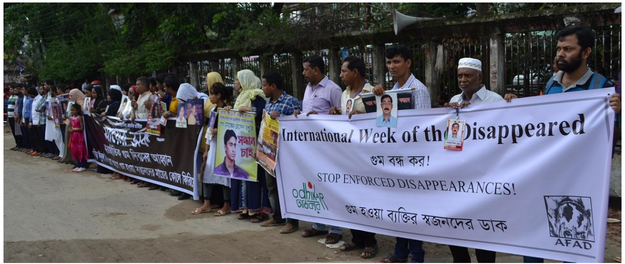
Odhikar organised a human chain along with the victim families on 26 May 2018 in front of National Press Club, Dhaka to demand the return of their family members on the occasion of 'International Week of the Disappeared'.

10. According to information gathered by Odhikar, from January to May 2018, 15 persons were allegedly disappeared<sup>23</sup> after being picked up allegedly by members of law enforcement agencies. Among them, the body of one disappeared person has been recovered, five have returned alive, six were shown as arrested after several days or months of their disappearance and the whereabouts three persons remain unknown.