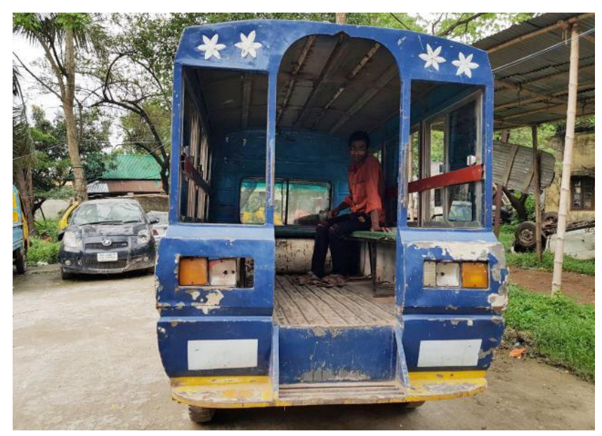
Leguna vehicle, seized by police at Tongi Police Station. Photo: Prothom Alo, 9 May 2018

30. Like previous months, the right to freedom of assembly of the opposition party BNP was violated in May 2018. Police did not permit BNP to hold peaceful programmes across the country and stopped their programmes in various places after attacking and arresting BNP leaders-activists. Police did not give permission to Jatiyatabadi Shramik Dal<sup>61</sup> for gathering at Suhrawardi Uddyan of Dhaka on 1 May to commemorate May Day. Police did not even allow BNP to hold an assembly in front of its party office at Naya Paltan on 7 May for the release and treatment of BNP Chairperson Khaleda Zia. 62 Meanwhile leaders and activists of the ruling party are holding meetings without any hindrance.