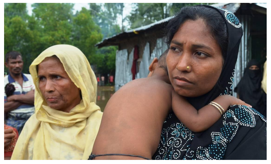
Rohingyas especially women are living their lives with past nightmare and uncertain future

Odhikar has taken interviews of the survivors. They are traumatised. They cannot sleep well because of horrible nightmare about the violence that happened to them. All the refugees Odhikar has interacted with asked in reply of the question regarding repatriation "why and to whom will we go there?" They don't want to face similar incidents again.