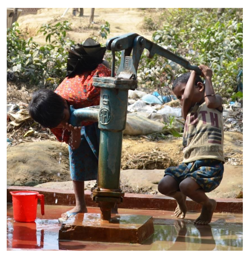
A Rohingya girl drinking water from a tube well, Photo: Odhikar