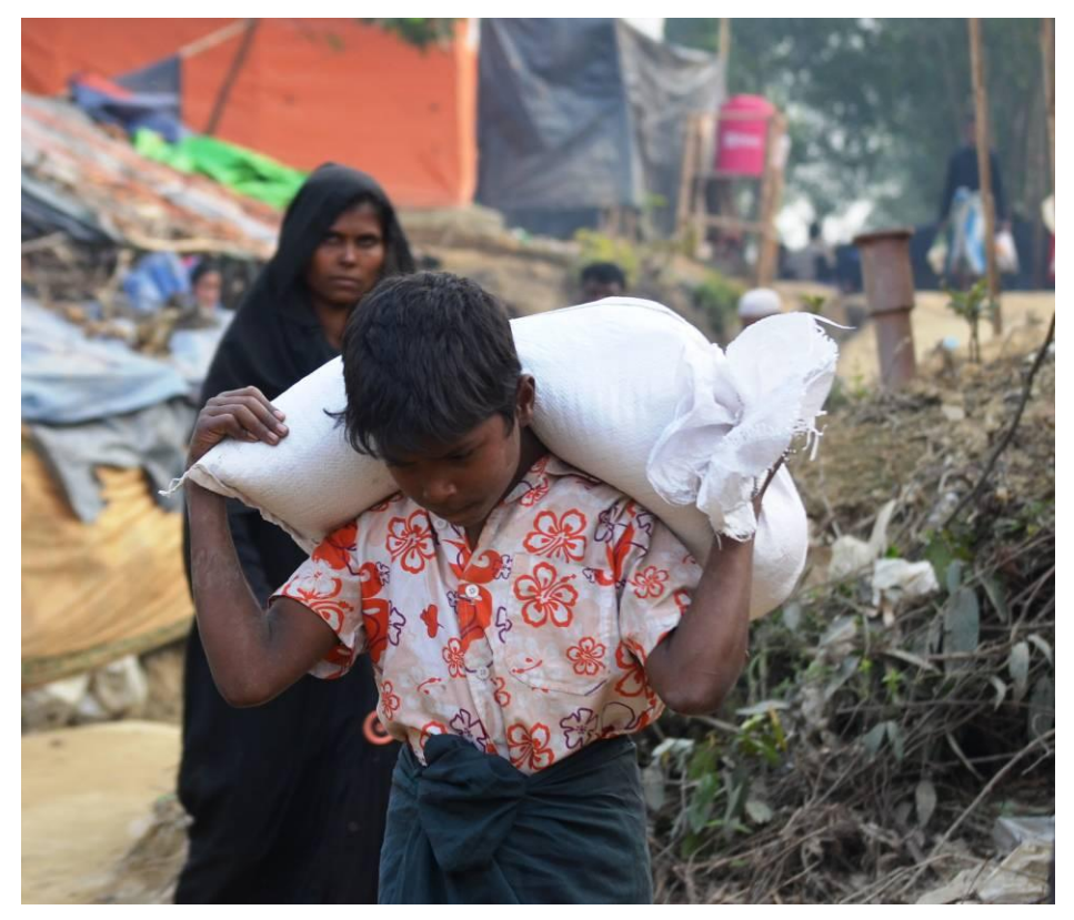
A Rohingya child carrying relief from the distribution center

The Rohingya refugees have taken shelter in Cox's Bazaar district in Bangladesh. There are 14 registered and unregistered camps in the Ukhiya and Teknaf areas. Some are Kutub Palong camp, Taingkhali camp, Nayapara camp etc. There are also extensions to those camps.