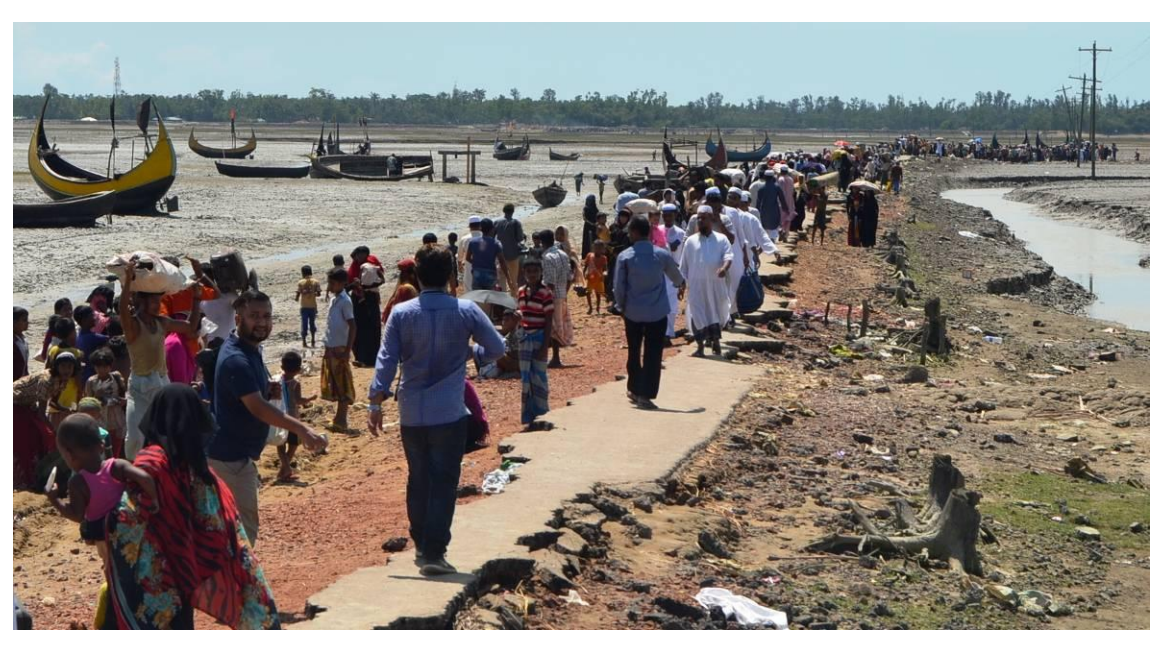
Rohingya refugees entering Bangladesh

To cross the Naf River, most of the Rohingyas used fishing boats. They had to pay money and give their ornaments to the boatmen or the boat owners to take them to Bangladesh. After coming to Bangladesh, they took shelter beside the roads and market places. At the beginning, it was very tough as the Bangladesh government was not willing to let them in. Many drowned in the Naf River when the Bangladesh border security system refused entry. Later, the Rohingyas were allowed to enter Bangladesh.