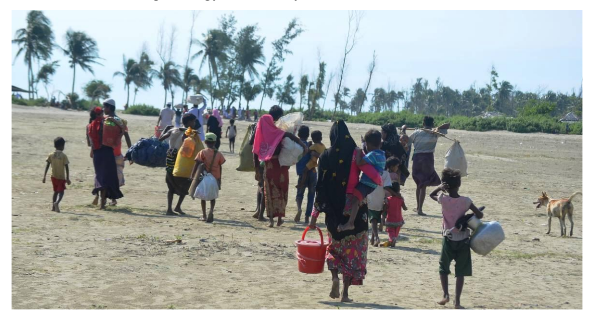
Rohingya refugees entering Bangladesh through Shahporir Dwip

In 2012 the Government of Myanmar and Buddhist criminals started their attempt to wipe out the Muslims. The government tried to hide this communal attack on Muslims by calling the violence a Buddhist-Muslim ethnic clash. The local government and the central government, at the behest of the police and security forces and Rakhine Buddhist criminals, became very enthusiastic about evicting Rohingyas out of Myanmar.<sup>6</sup>