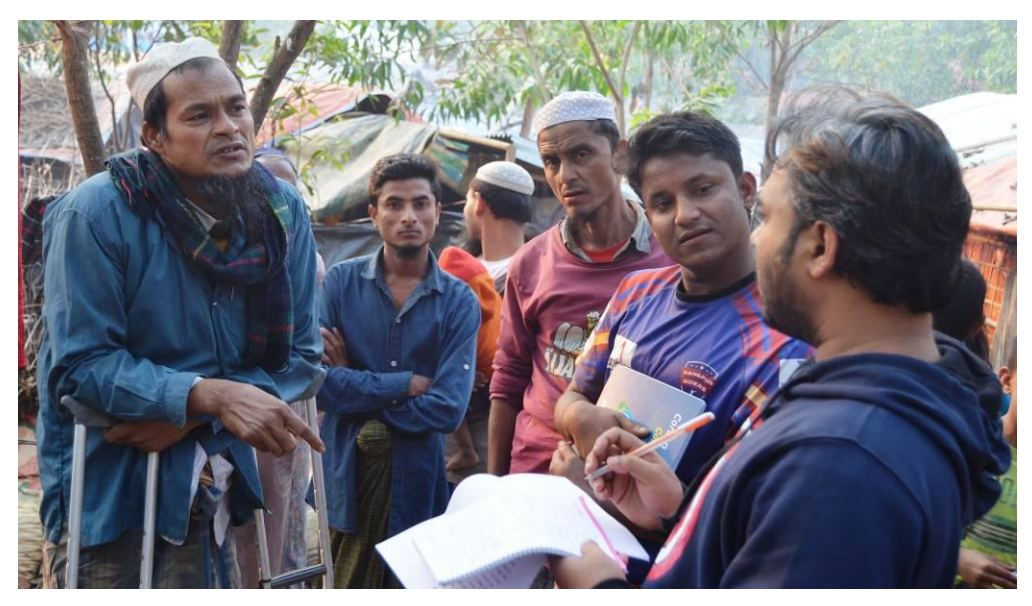
Information collection from a victim, Photo: Odhikar