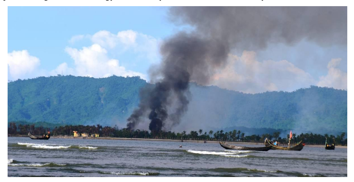
Smoke from the burnt houses in Myanmar, Photo: Odhikar

Village<sup>23</sup>. After those attacks, the Myanmar government has been conducting various operations against the Rohingya community in the Rakhine state of Myanmar.