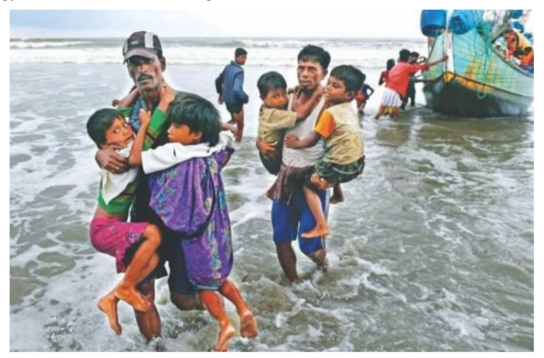
Rohingyas arrive at Teknaf crossing the Naf River. Photo: The Daily Star, 8 September 2017

To cross the Naf River, most of the Rohingyas used fishing boats. They had to pay money and give their ornaments to the boatmen or the boat owners to take them to Bangladesh. After coming to Bangladesh, they took shelter beside the roads and market places. At the beginning, it was very tough as the Bangladesh government was not willing to let them in. Many drowned in the Naf River when the Bangladesh border security system refused entry. Later, the Rohingyas were allowed to enter Bangladesh.