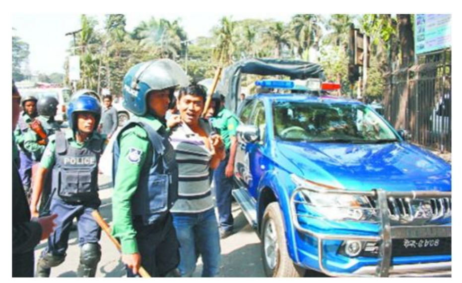
A BNP activist was arrested from Motshya Bhaban area in Dhaka. 10 February 2017