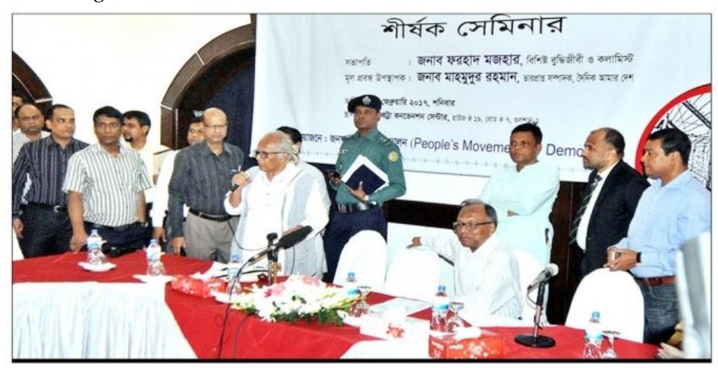
Police stopped a seminar titled 'Killings at Border: Obligation of the State' organised by People's Movement for Democracy at the Spectra Convention Centre in Gulshan, Dhaka. Photo: New Age, 26 February 2017