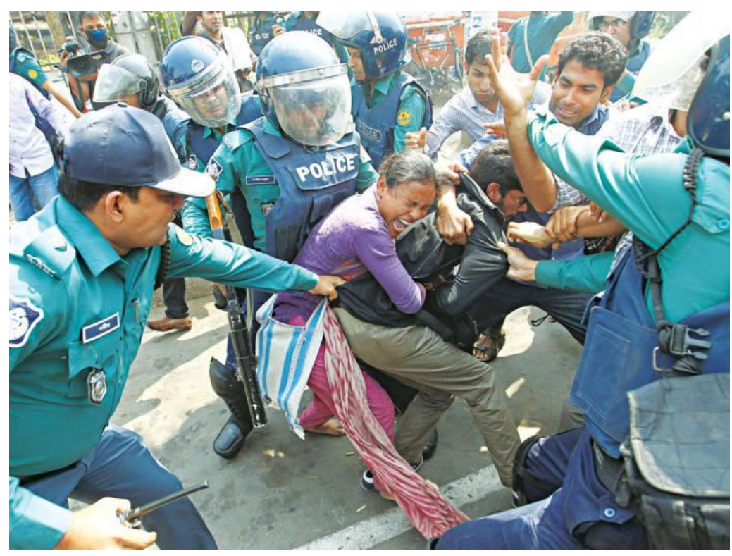
Leaders and activists of various left-leaning organisations assembled at Shahbagh area during hartal. Police attacked and arrested several hartal supporters. Photo: Prothom Alo, 1 March 2017

Jote<sup>20</sup> took position at Shahbagh in Dhaka and blocked the road. Police attacked and baton charged the protesters and threw tear gas shells at them. A few student activists were injured and 10 protesters were arrested.<sup>21</sup>