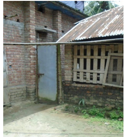
Two plain clothed policemen entered the house through this place (circled) and this is the main gate of the house (right)