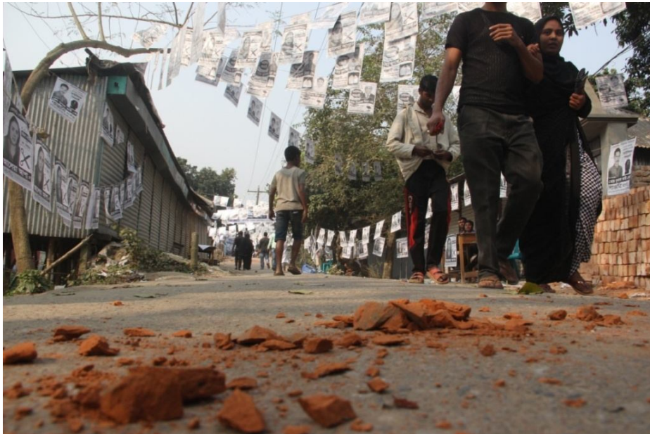
Brick-bats used during violence in Panam area under Sonargaon Municipality in Narayanganj.

Municipality chanting slogans for the ruling party candidate and attempted to take control of the polling stations. The Officer-in-Charge of the Sonargaon Police Station, Manzur Kader was injured in the clash.