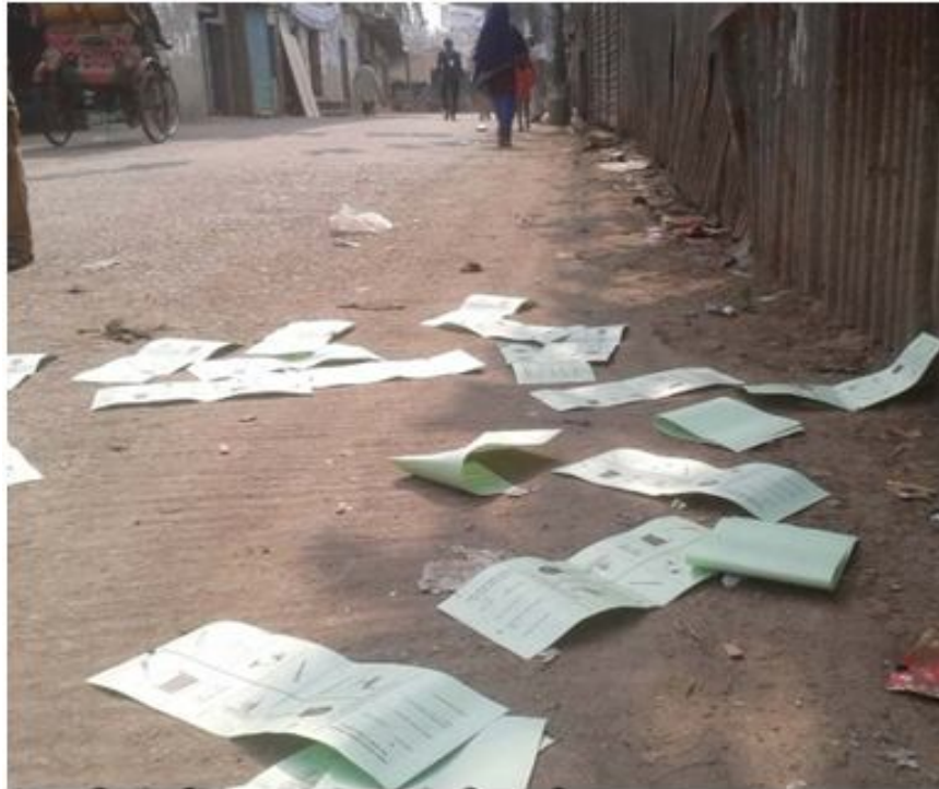
Ballot papers spreading out on street in the Choumuhni Municipality