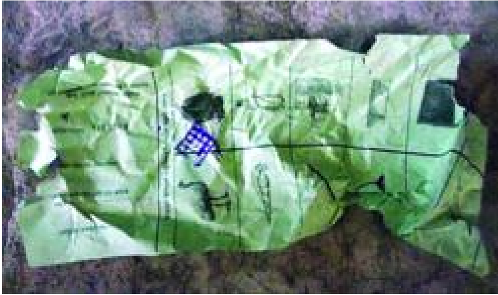
Torn ballot paper lied under the table at a polling booth in Bazaar Government Primary School in Moulvibazar Municipality.