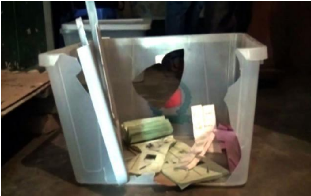
Criminals vandalised ballot boxes in the Panjupara polling station in ward-8 of the Kuakata Municipality.