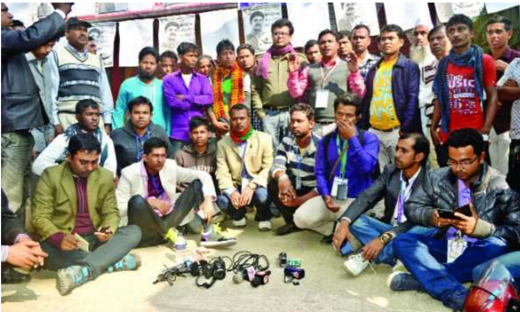
Journalists in Sunamganj stopped their work in protests of attack at them