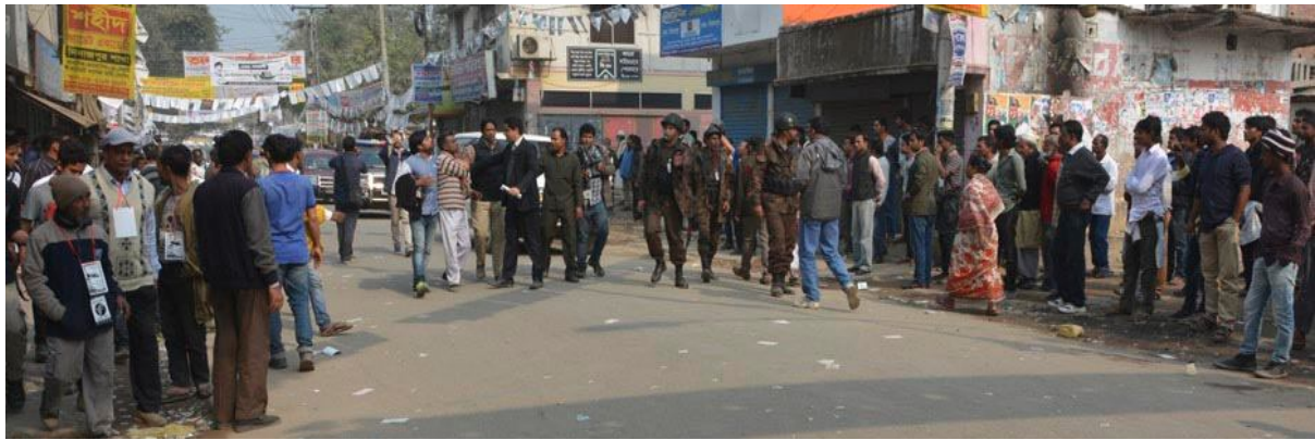
Police arrested a BNP supported councilor candidate and his six supporters from Cricent Kindergarten polling center.