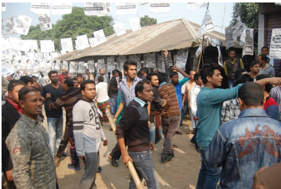
Supporters of the ruling party outside the G R Institute polling centre in Sonargaon.