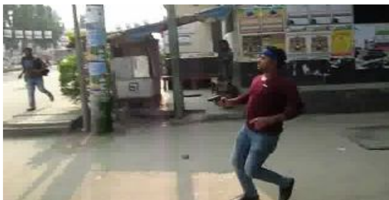
A youth holding pistol while gunfight between supporters of the AL-nominated Mayoral candidate Foysal Ahmed Biplob and the supporters of the Councilor candidate, Makbul Hossain in Munshiganj.

At around 11:00 am, supporters of the AL-nominated Mayoral candidate Foysal Ahmed Biplob was locked in altercation, including exchange of gunshots with the supporters of the councilor candidate, Makbul Hossain, who was being patronised by the local MP from the AL, Mrinal Kanti Das. The incidents occurred at Hatlakshmigaj and Idrakpur polling stations. At around 1:00 pm, the Munshiganj High School polling station witnessed outsiders standing in queue and casting fake votes on one hand and valid voters being intimidated in public, into voting for the AL-nominated Mayoral candidate. 40