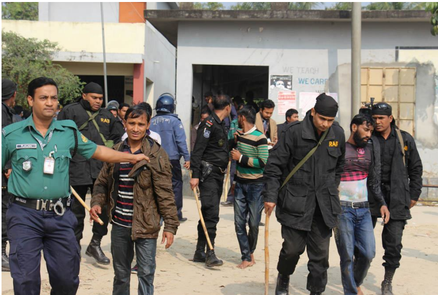
Police and RAB arrested some criminals from the Bhabanipur Primary Schoiol polling centre in Sujanajar Municipality.