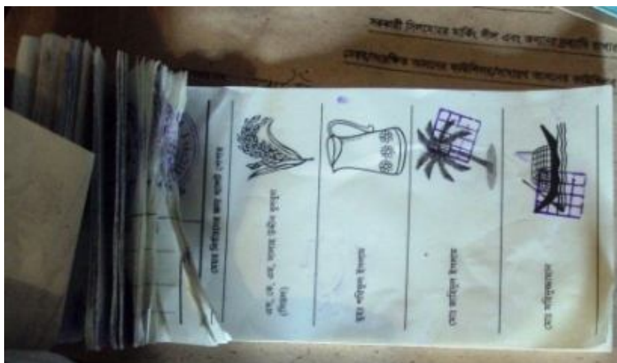
The electoral officials cancelled ballots stamped with symbols of boat collected from Kotchandpur Dudhchora Primary School polling station.

At around 10:00 am, the BGB reportedly seized 300 ballots, all stamped with symbols of boat (symbol for AL candidate), from Kotchandpur Dudhchora Primary School polling stations. At around 2:00 pm, they also seized another 50 ballots, stamped with the same symbol, from Akh Centre. The ballots were seized while being stuffed into ballot boxes. 60