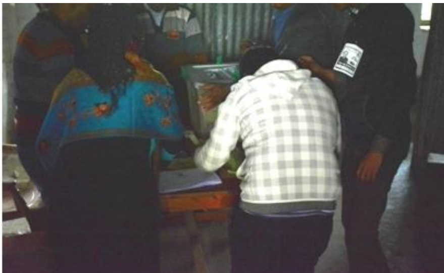
Supporter of the ruling party stuffing ballots in favour of the AL-nominated Councilor candidate at Khepupara Nessaruddin Fazil Madrassa polling centre in Kolapara Municipality.

Then the AL men established their complete control over the polling centre by forcing the journalists to leave. The Patuakhali District Correspondent of Channel I (a satellite TV channel), Enayetur Rahman was forced to leave the polling centre when he was going to photograph the booth capture. What happened behind closed doors in the room of the presiding officer G M Nazrul Islam was ballot stuffing by the supporters of the AL candidate, with the law enforcers keeping their distance apparently to endorse what was happening. Even though the law enforcers got back to the polling station half an hour later, the AL candidate's supporters still continued their grip on the polling station. More interestingly, while the law enforcers were apparently on duty outside the polling station, ballot stuffing continued unchecked inside the polling booths. 52