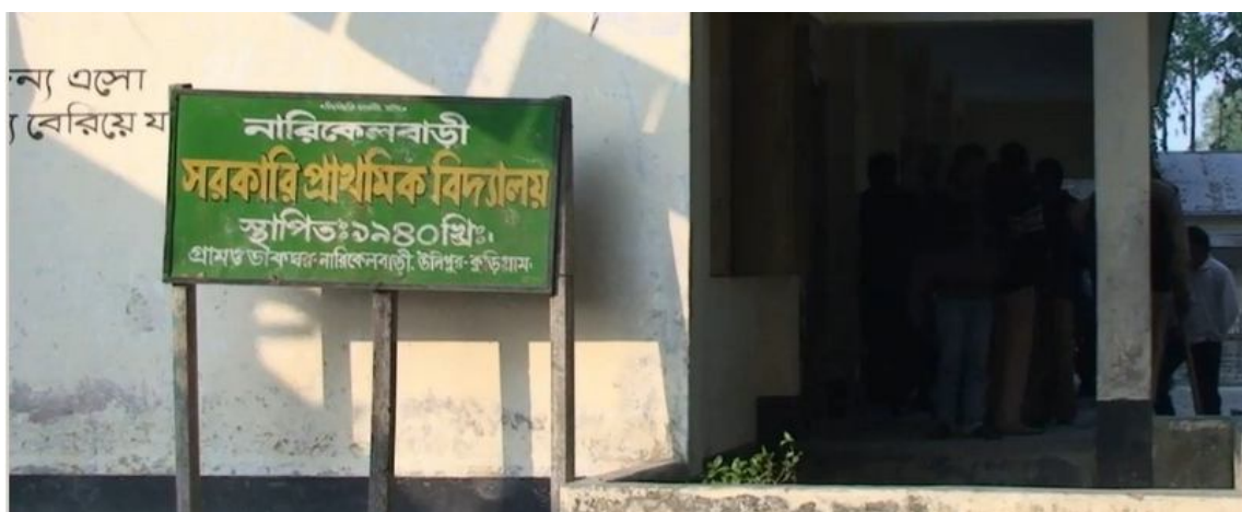
Narikelbari Government Primary School polling centre in Ulipur Municipality under Kurigram District– Photo: collected

Five persons were injured as clashes erupted between supporters of rival candidates for Councilor positions, Kaiser (with electoral symbol ‘Camel’) and Noor Islam (with electoral symbol ‘Apple’) at around 1:00 pm in the polling station housed at the Narikelbari Government Primary School.