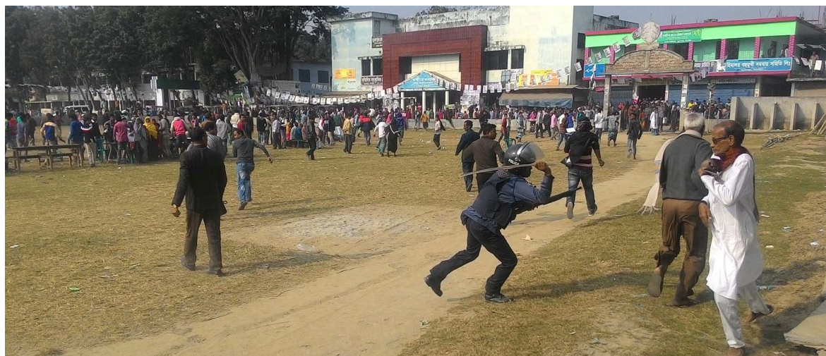
Police baton-charging at Bhuapur Model Pilot High School polling station in Bhuapur Municipality.

election results and number of ballots submitted to the centre. Later on, he prepared a new count of ballots to match the results and submitted it to the polling centre. 31