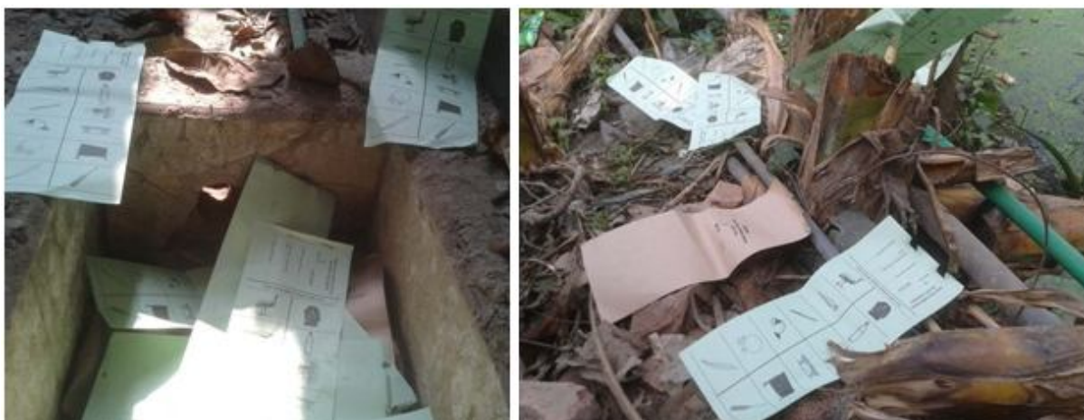
Ballot papers spreading at various places, including dustbin in Choumuhni Municipality – Photo: collected.