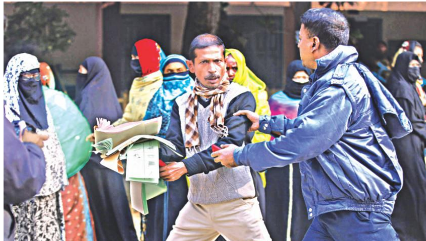
Snatching ballots in the Police Lines Secondary School polling centre in Jessore.