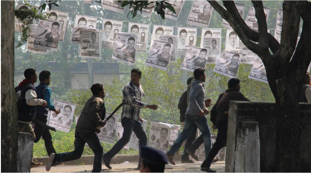
A violent altercation in Bhabanipur Primary Schoiol polling centre in Sujanajar Municipality under Pabna District.