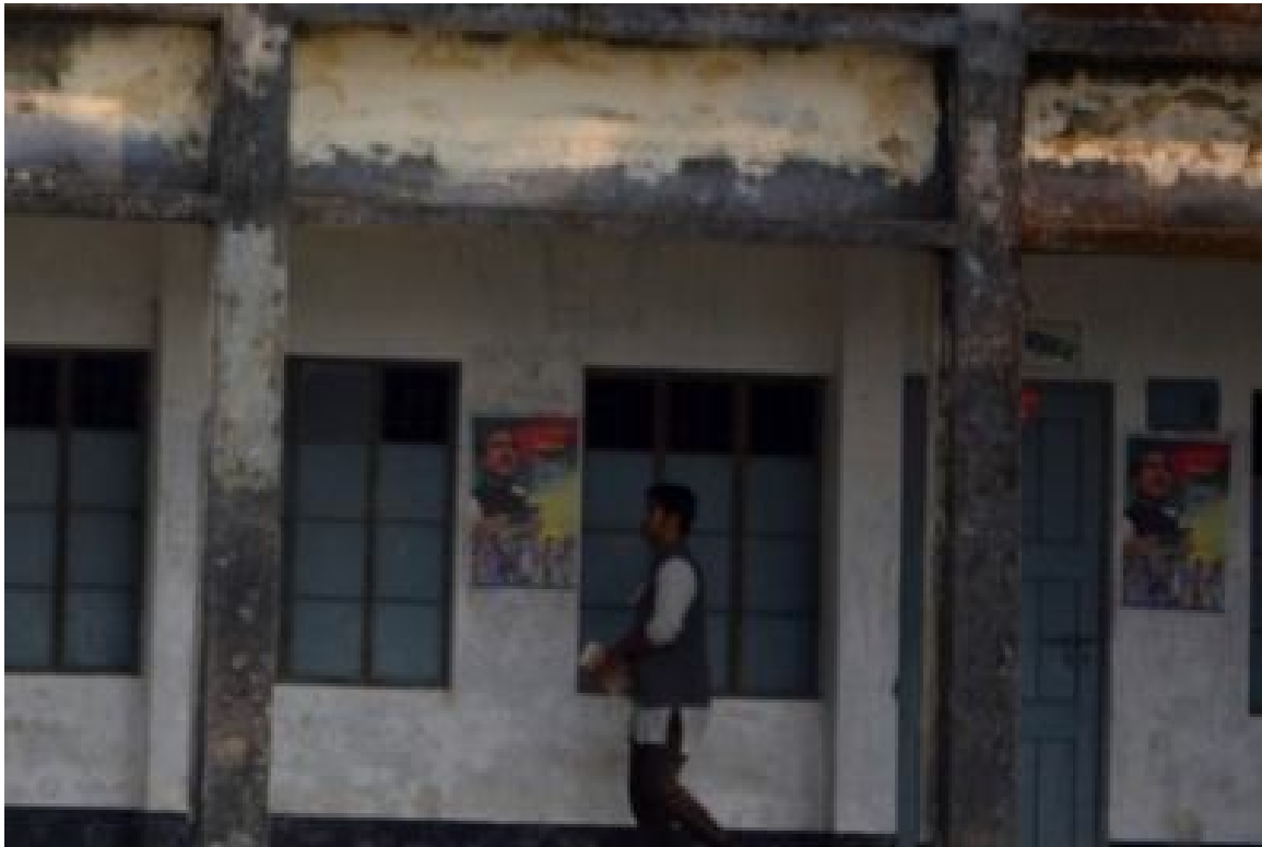
A supporter of the AL candidate taking ballot papers from the Presiding Officer's room at the Mojahar Uddin Degree College in Kolapara Municipality.