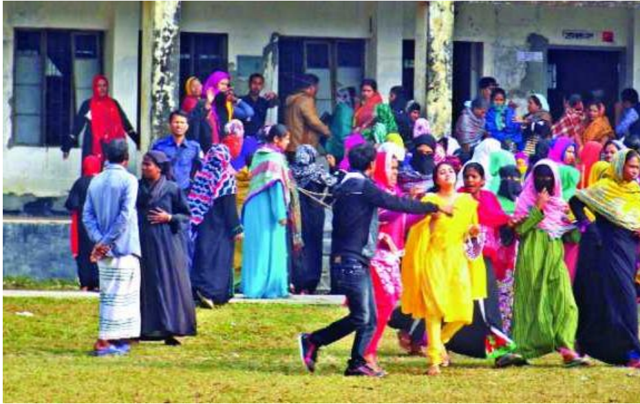
Female voters are forcibly ousted by the ruling party activists from Mojahar Uddin Degree College polling centre in Kolapara Municipality.