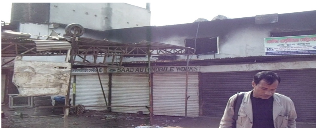
Damaged Smart Export Garments limited on the 1 st floor and automobile workshops and other shops on the ground floor