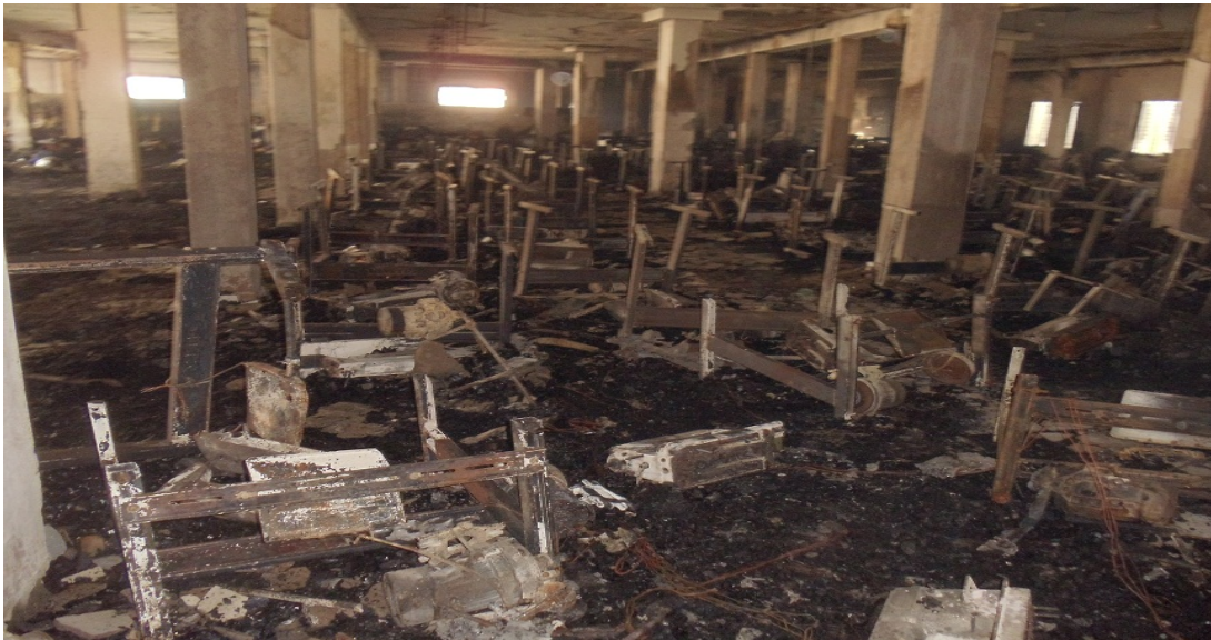
Inside of Smart Export Garments limited's factory where no fire extinguishers were seen