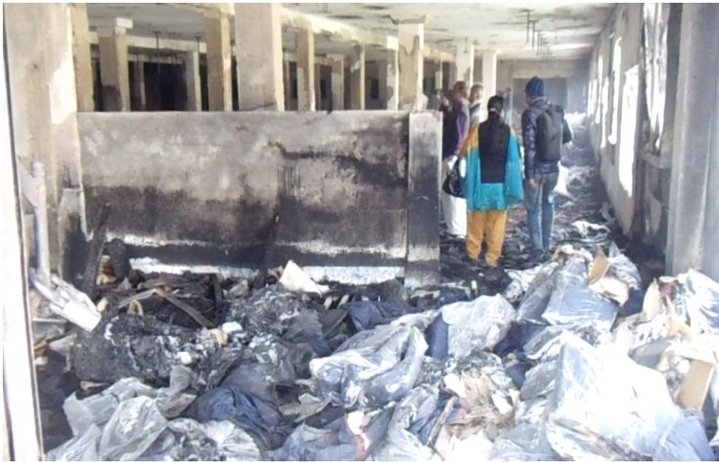
The pile of jhute (waste material) kept at the exit point of Smart Export Garments limited