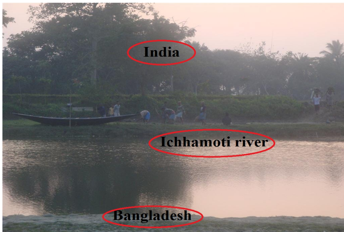
Photo: Bangladesh-India border divided by Ichamoti river