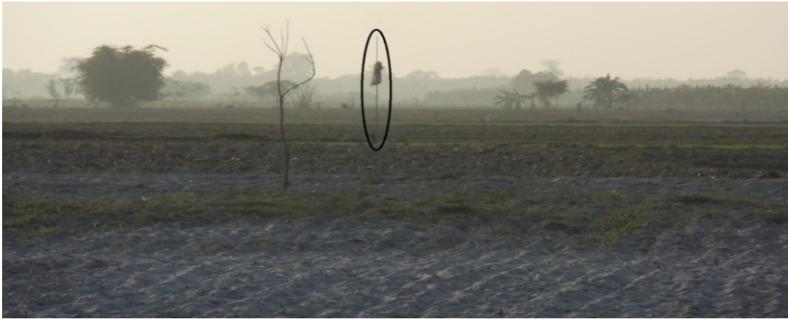
Photo: The circled area shows that since there is no border pillar, a bamboo stick has been used to determine the Bangladesh-India border at that point. (date: December 23, 2012)