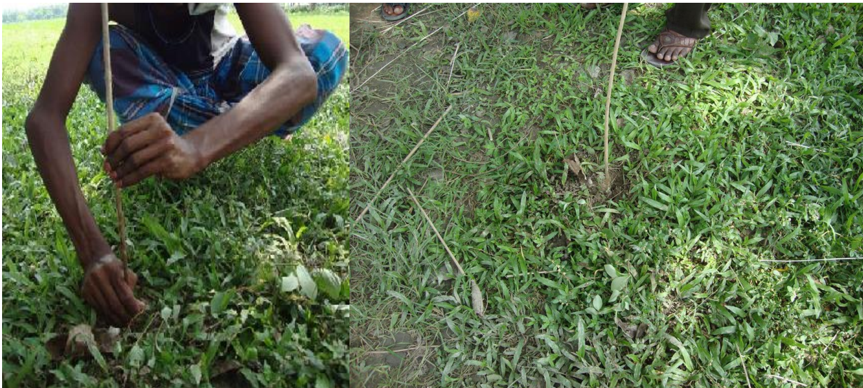
Photo 1: Using a stick, a man is showing the hole that the bullet made in the ground. Photo 2: An eyewitness is showing the bullet hole in the ground.

Monirul Islam told Odhikar that on September 18, 2012 at around 3:45 am, he woke up to the sound of a car. He got out of his house and using his torch he saw three police vans parked on the road leading to Kursha Eidgah field beside his house. There were also a few policemen standing on that road with torchlight and arms. Two policemen were hustling a man. At one point the policemen took the man to the Eidgah field and pressed him face down onto the ground. A few minutes later, he heard sound of gunshots. He saw that after shooting the man to death the police officers themselves began shouting “Help! Help! Miscreants are trying to kill us!” After hearing the gunshots and screams of the police locals gathered at the Eidgah field and saw Rahat’s body lying on the field. He said that since Rahat was shot by forcing him onto the ground the bullet pierced through his body and about quarter a yard into the ground. Later the police officers took the body away on a van.