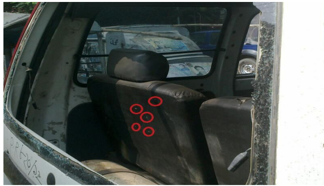
Gun fires broke the glasses of the microbus and the circles indicate the bullet hits.