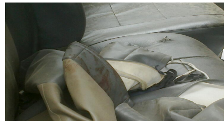
The photo from the left shows the place near the Talukdar Filling Station where Roni, Noyon and others were beaten for second time, and (Right) shows bloodstains where Roni sat.