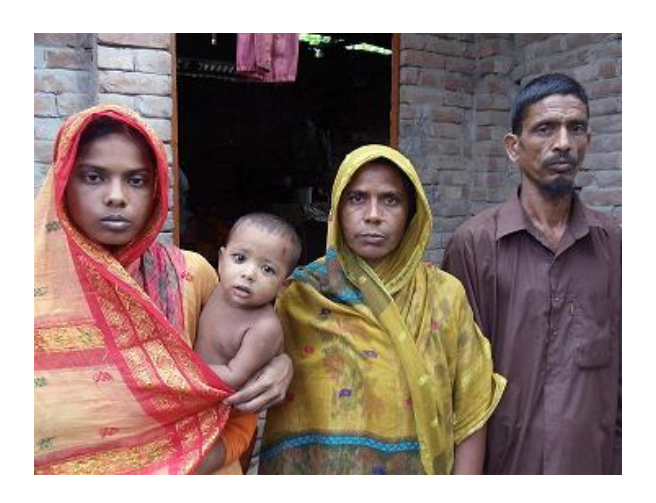
Sanaul's wife, child and parents