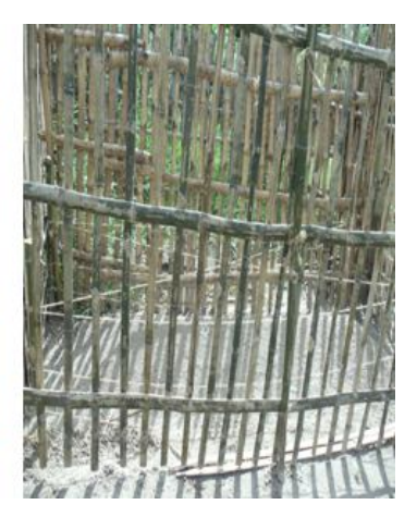
Pic 1.The place where Sanaul found lying after being shot. Pic2. The circled area under his right eye is where he was shot (photo collect) Pic3. Sanaul's grave