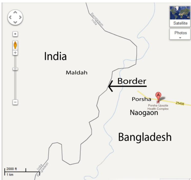
Map of the border between Duarpal village of Porsha Upazila in Naogaon district and Dalla village of Horipur Thana in Maldah district of India